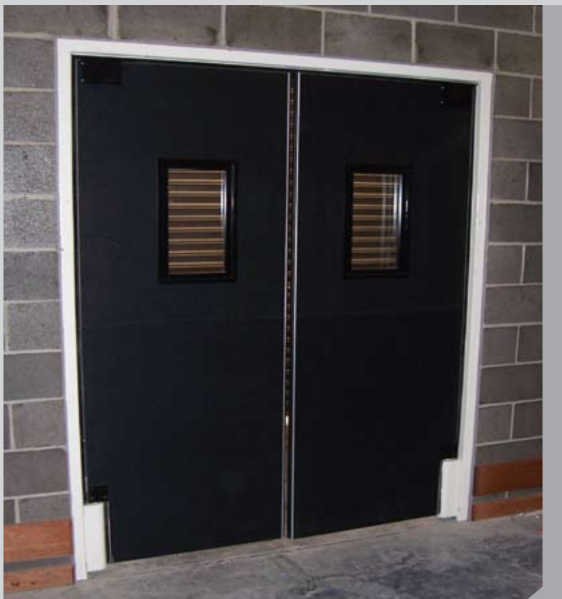
Double door designed to withstand heavy traffic from personnel trolleys and powered equipment