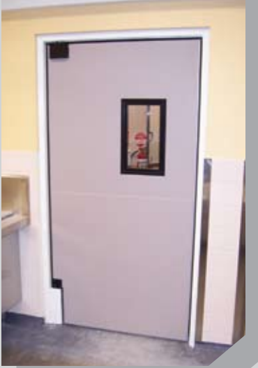
Oyster single door used in a deli retail area