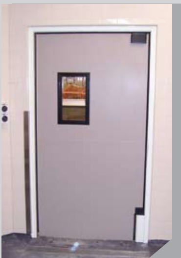
Single oyster door food prep and bakery