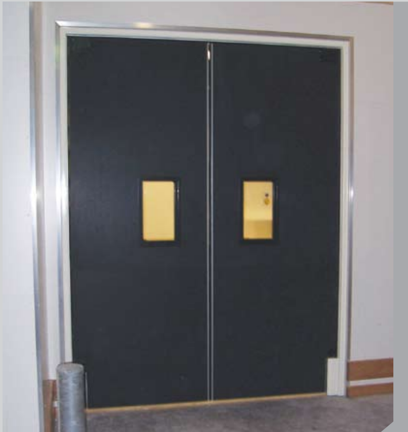
High performance double black high impact door separates the storeroom from the retail area