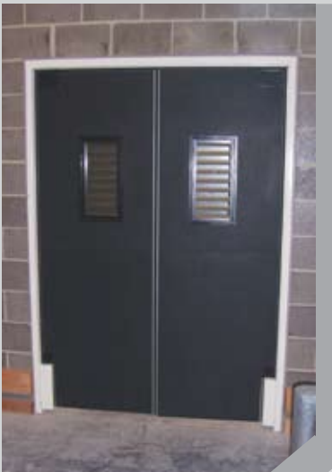
Black double door storeroom loading area