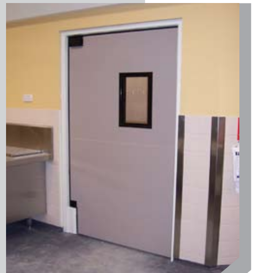
Single high impact door performance and presentation